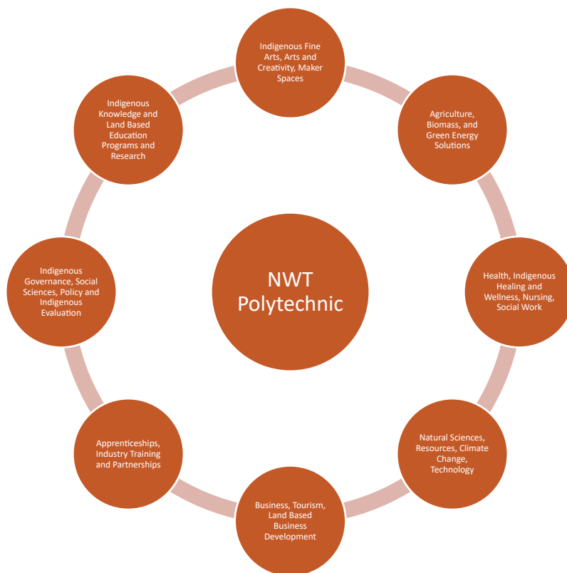
Figure 2: Potential Affiliations/Partnerships and Program Areas of an NWT Polytechnic Based on Existing Knowledge Economy Organizations, Initiatives, and Research Activities

Figure 2 provides an illustrative possible example of the role of a polytechnic as a catalyst for the NWT KE. A polytechnic could provide administrative and financial support to KE organizations and initiatives by making those organizations affiliates or campuses, ensuring that expertise is focused on research and programming instead of administration. Affiliation relationships could see academic funding grants being administered by the polytechnic on behalf of the affiliated organizations, and the polytechnic consequently receiving significant additional funding provided under the federal Research Support Fund 28 —designed to provide funds to post-secondary institutes to cover the costs of research grant administration. Highly qualified personnel in affiliated organizations could focus on doing research and training, while governance, finance, and administration responsibilities would be taken on by the polytechnic. Affiliates in turn could provide highly qualified staff to teach and research with the polytechnic, and polytechnic staff and students could be involved in research and capacity building in NWT communities.