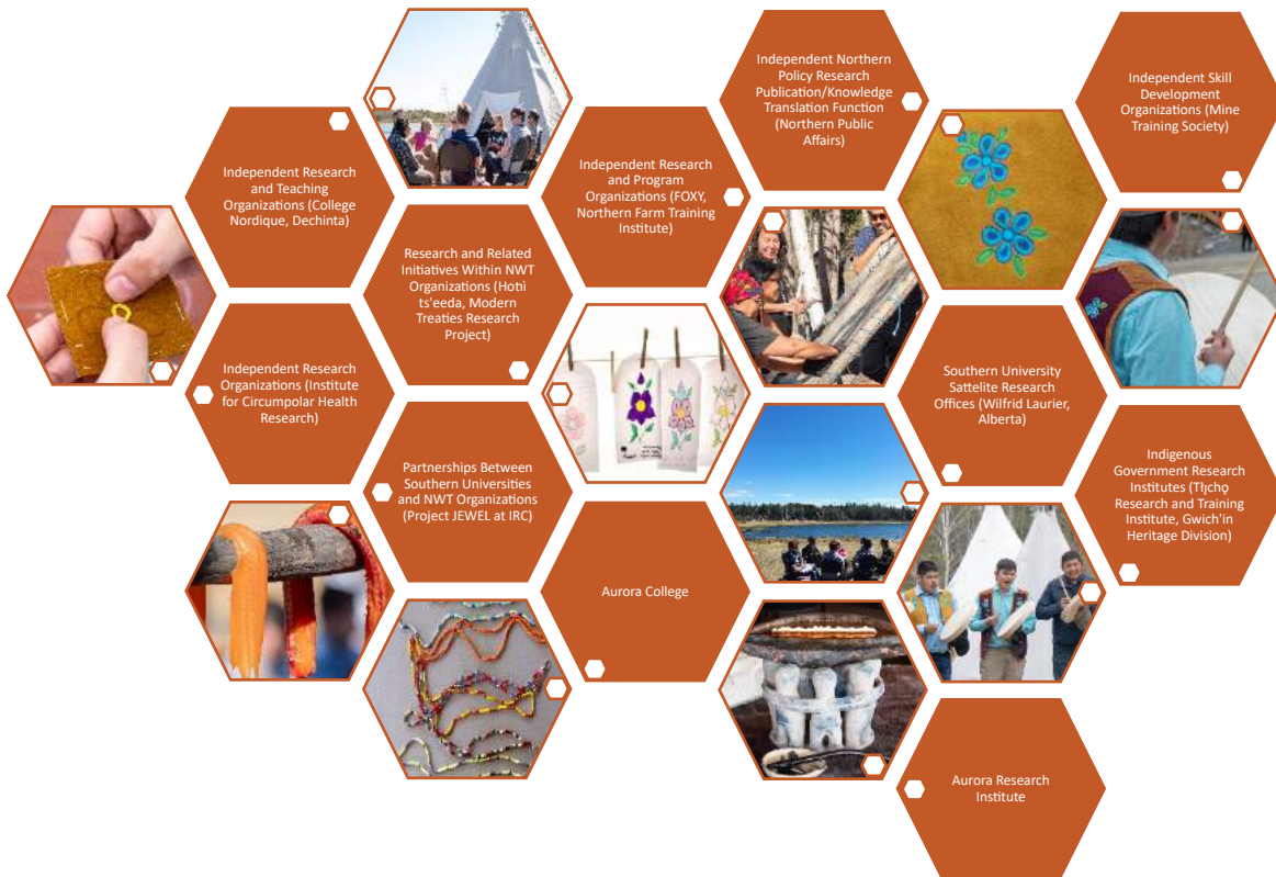
Figure 1: Current Fragmentation Between NWT Knowledge Economy Organizations and Initiatives

Figure 1 provides examples of KE organizations that have been established in the NWT over the last two decades. Arguably, if an NWT polytechnic were in place, the non-GNWT organizations depicted here could add to the strengths of a polytechnic—either by becoming programs within academic departments or operating as affiliated institutes or campuses. Most of the non-GNWT organizations in the figure have their own Boards of Directors; finance, administration, and HR functions; and, are sometimes in competition for scarce funding. Many partner with NWT communities or Indigenous Governments and organizations on different projects and lack formal opportunities for connecting and collaborating together that a post-secondary catalyst organization, such as a polytechnic, could provide. NWT KE organizations and initiatives have developed in direct response to needs and circumstances in the NWT. Founders, host organizations, and their staff have had to develop entrepreneurial and creative approaches to doing their work, accessing funds, connecting with NWT research and training needs and engaging in partnerships with communities and southern institutions.