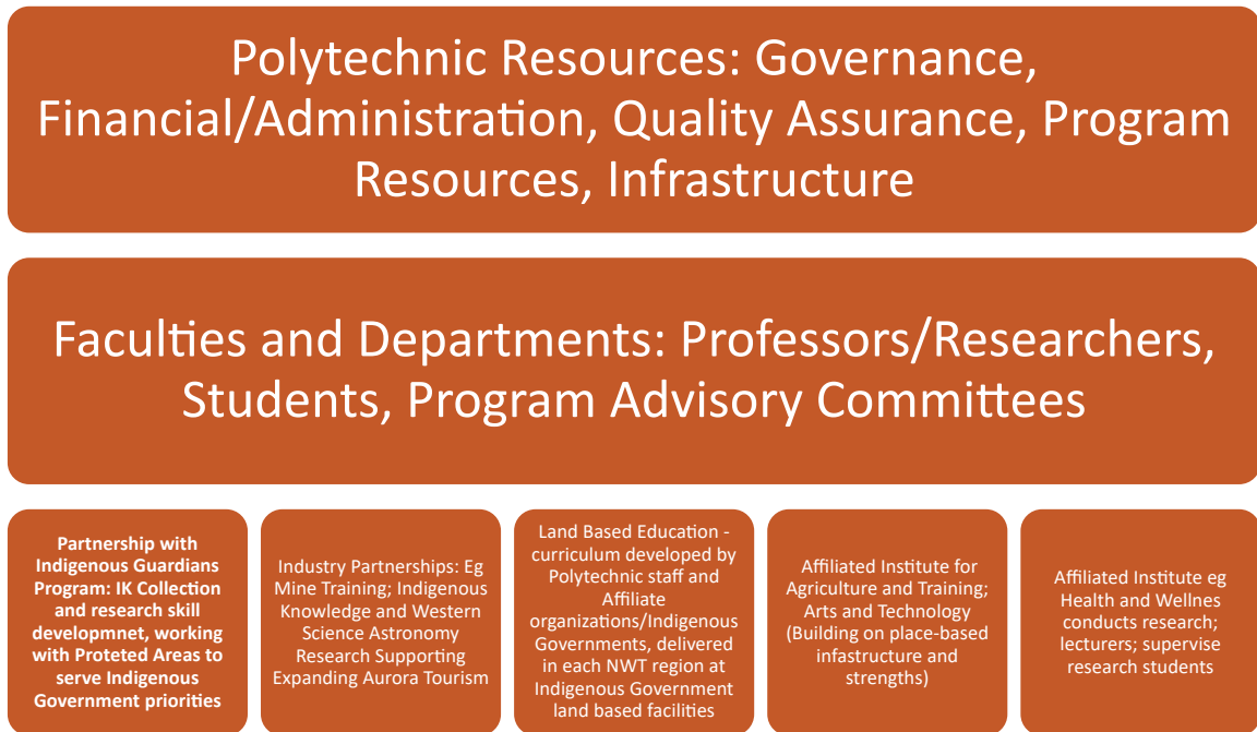
Figure 3: Illustrative Examples of Relationship/Supports: Polytechnic – Affiliates - Partnerships

(health, mining, climate change), but that could benefit from cooperative relationships to leverage their existing funding. Were the NWT KE anchored by a robust and well-respected post-secondary institution, affiliated organizations could focus their resources and talent fully on programming, rather than dividing resources between programs and administration, while being positioned to take advantage of partnerships and synergies offered by a common institutional base.