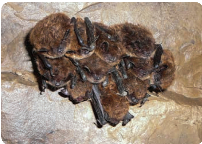
Little brown myotis

The Assessment Schedule is subject to annual review and modification.