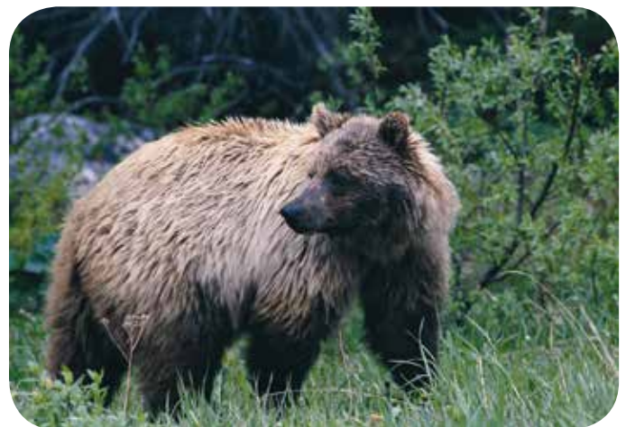
Grizzly Bear

All Species at Risk Committee documents, including species status reports and assessments, are available on the NWT Species at Risk website: www.nwt-speciesatrisk.ca