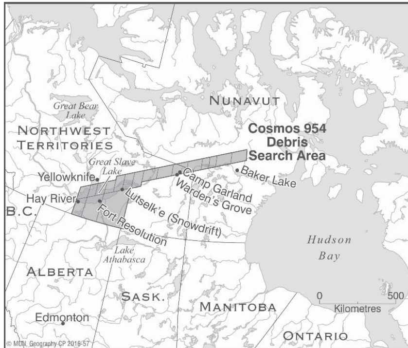
Figure 1. The Cosmos 954 debris field as covered by Operation Morning Light. The long upper arm represents the initial search area based on the satellite trajectory. This search area was later expanded south towards Alberta and Saskatchewan. Map by Charlie Conway.

The subsequent military-led effort to remove this widespread radioactive contamination was a laborious process. It involved hundreds of ground personnel and cost the Canadian government nearly $14 million. 3 Dubbed Operation Morning Light, the search for satellite debris lasted about eight months and encompassed a vast, remote swath of northern Canada. The operation required both extensive aerial surveys and the use of ground search teams, as well as the establishment of a temporary military base near the Thelon River. In April 1981 Soviet and Canadian diplomats signed a compensation settlement of $3 million to be paid from the USSR to Canada. 4 After that time, Operation Morning Light disappeared quickly from the media, though not necessarily from the memories of northerners, who had experienced the impacts of the crash and recovery mission firsthand.